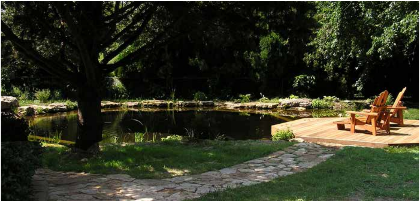
Fig 2.1 A Natural Swimming Pool by Total Habitat (Susie Pool)

The goal of this book is to enable you (the home owner or contractor) to dive into a natural swimming pool project and successfully emerge. We believe that in years to come natural swimming pools will be more popular than traditional pools. The triumph of the natural swimming philosophy is built one pool at a time. We are dedicated to giving you the best information, products and methods to make your project a lasting, scenic heirloom.